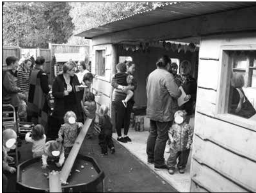
Some faces have been obscured for privacy reasons.

No stone was left unturned in her scrutiny of our setting. In her feedback to us, the inspector told us that we’d achieved the grade of Outstanding. In fact she said that we excelled in every area. So no surprise that we burst into tears!