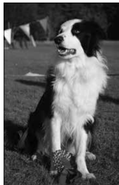
Sky with her 2nd place rosette at the Toto audition