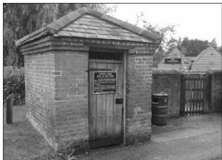
Clophill's Lockup and pound