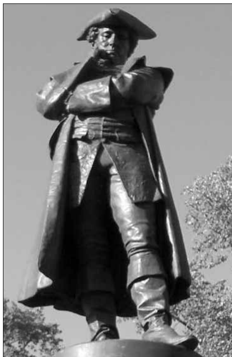
John Howard's statue, St Paul's Square, Bedford